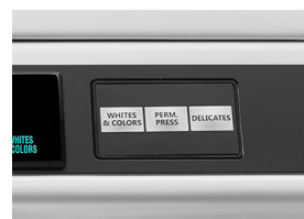
ONE-TOUCH CYCLE SELECTION