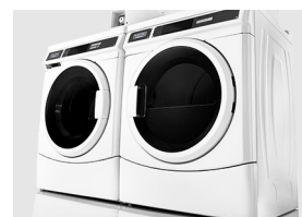
MATCHING WASHER AVAILABLE