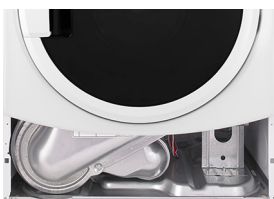
FRONT ACCESS PANEL