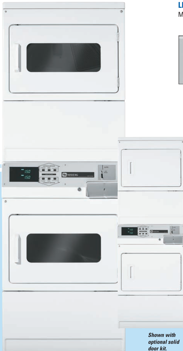
Shown with optional solid door kit.